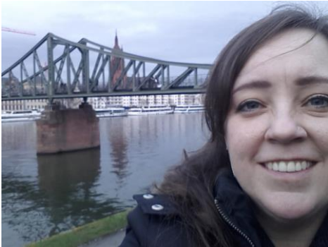
spending Christmas 2013 in Frankfurt, Germany

celebrating Eid in October, moving to a new apartment with a lovely balcony garden; feeling at home after six years; tutoring on the side; planning another adventure by traveling to Prague, Czech Republic for Christmas 2014