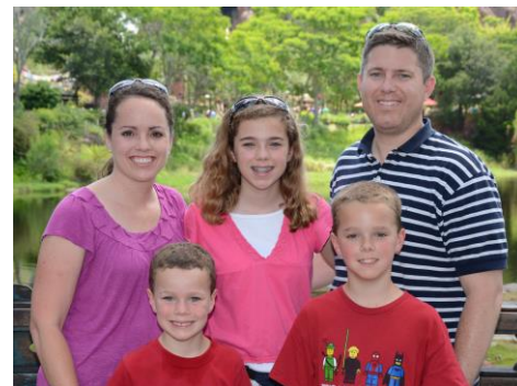
All of them taking care of their playful 90-pound English Golden Retriever and missing her while they were at Disney World and on trips to grandparents (next column in the Dallas area)