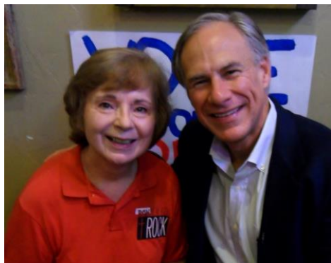
Texas Attorney General Greg Abbott won the election for Texas Governor in November 2014.