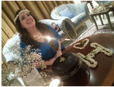
being recognized on her birthday with Emirati traditions

students, adding sixth grade to seventh and eighth grade responsibilities; coordinating Week Without Walls field trips; advising Student Council