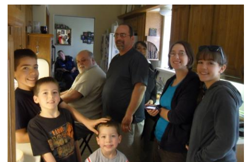
Herb’s family all fit in Grandpa’s kitchen in Plano in September.