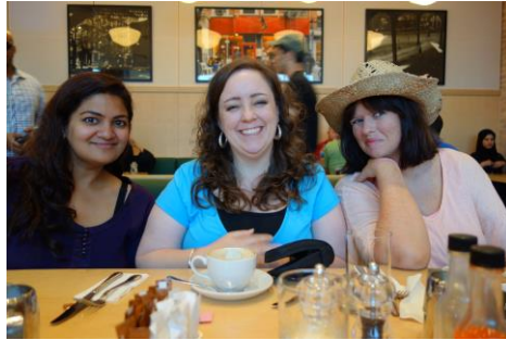
brunching, mani/pedis, massages