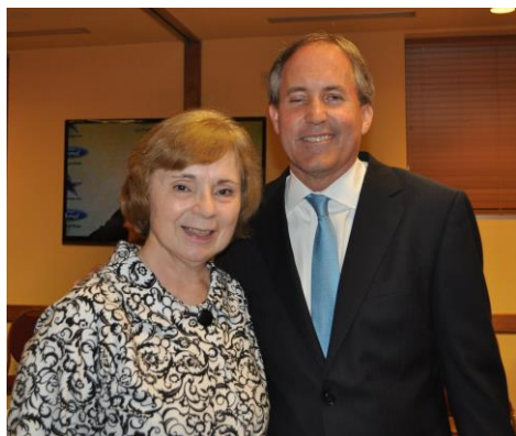
Our friend, State Senator Ken Paxton, won the general election for Texas Attorney General in November.