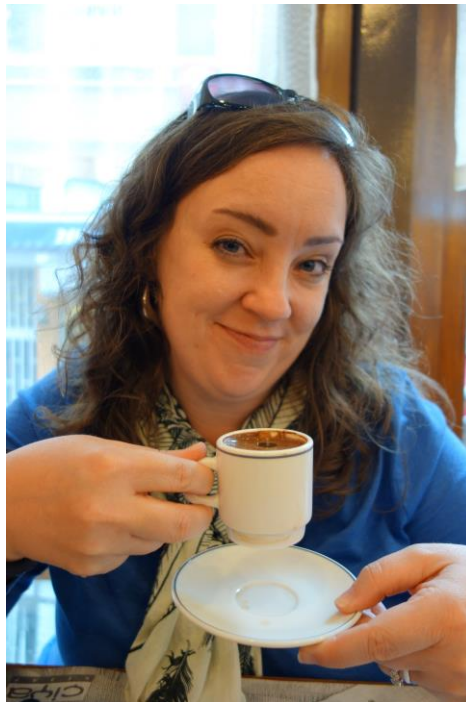
generally enjoying the Dubai lifestyle