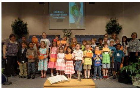
Book readers celebrated in April 2014 and chose new books (below).