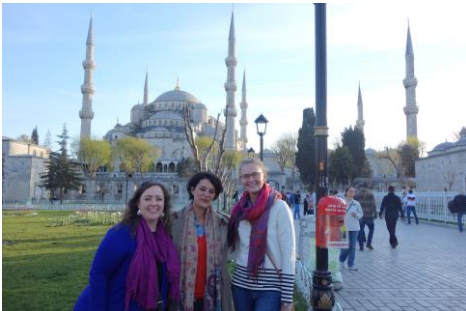
enjoying spring break in Istanbul, Turkey with friends